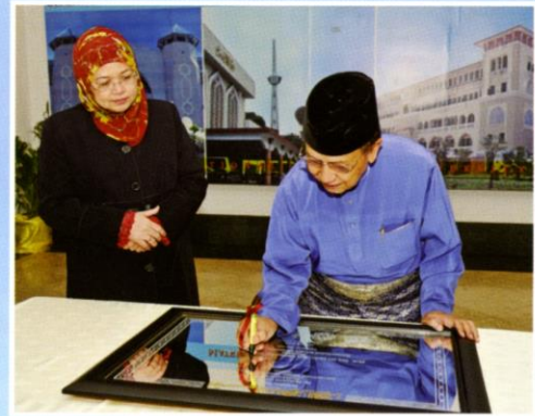
Tan Sri Dr. Rais Yatim signing a plaque to mark his official first day duty as President of IIUM.